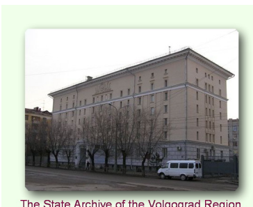
The State Archive of the Volgograd Region

Archive of Volgograd Region give mostly a true view of the events of the World War I (1914-1918). This information resource requires careful historiographic analysis, and yet is of considerable interest for culture-historical research.